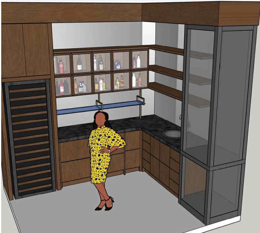
BASEMENT BAR Scale: 1/2" = 1'-0"